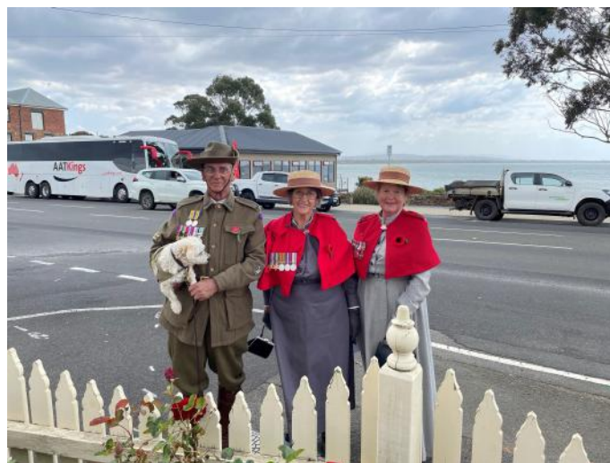
Tasmanian Light Horse

decade after the end of World War I almost the same number over 60,000 men and women passed away because of their service.