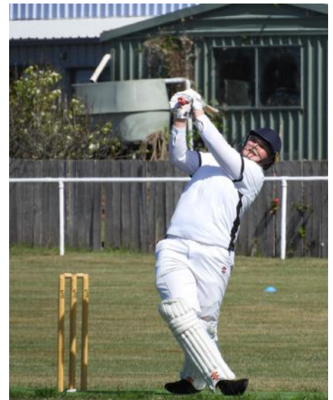
Buckland v Swansea at Swansea Oval