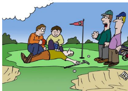
"Do you mind if we play through...?"