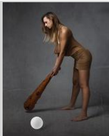
Ladies golf circa 25,000BC