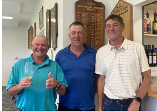
This weeks winners

REMINDER: AGM – FRIDAY 24 TH FEB. @ 7.00 PM