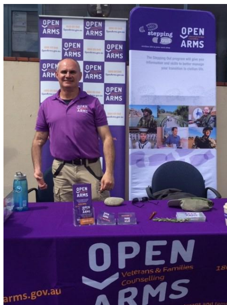
Open Arms, Veteran & Families Counselling