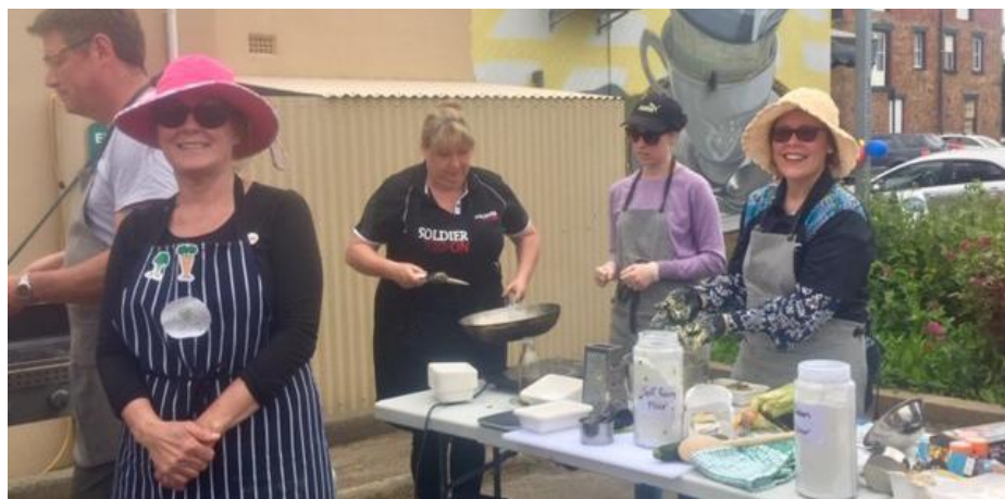
Local's healthy cooking competition.