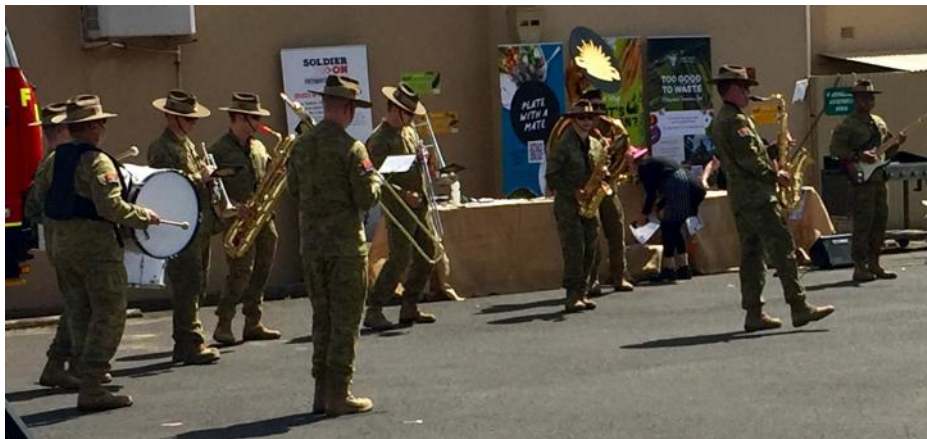
The Australia Army PET Band (Army Reserve Band)