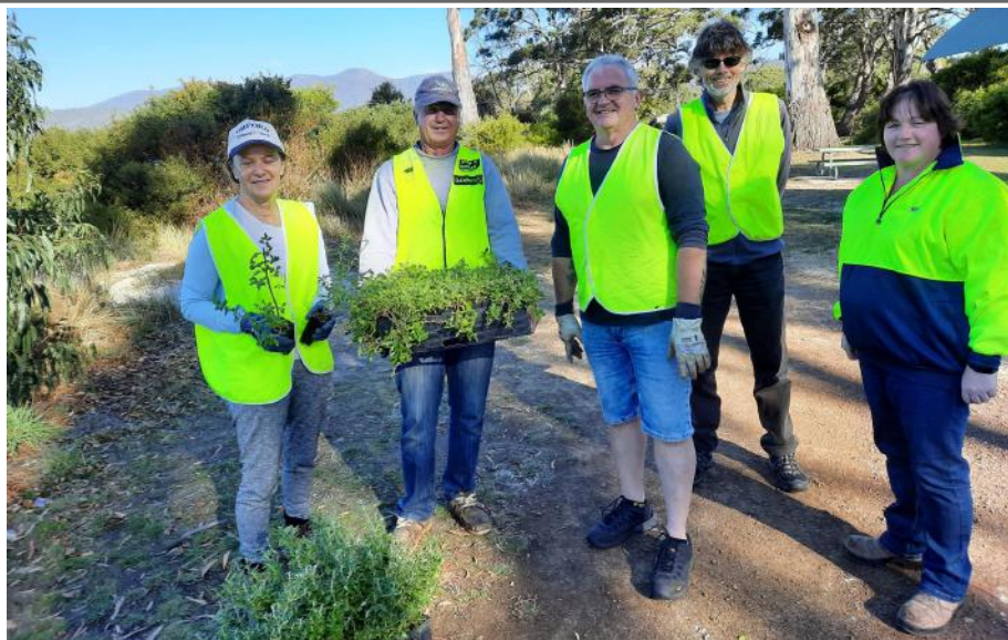
Orford Community Group working to revegetate Raspin's Beach reserve