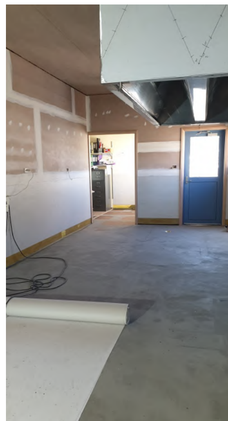
The same area showing the difference from 28 th June and 9 th August.