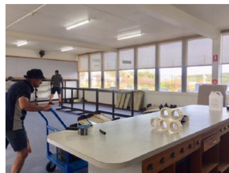
The last few items to go