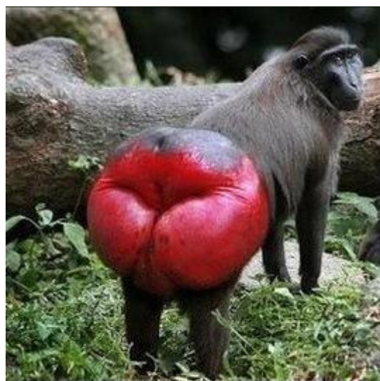
DOES MY BUTT LOOK BIG TO YOU?