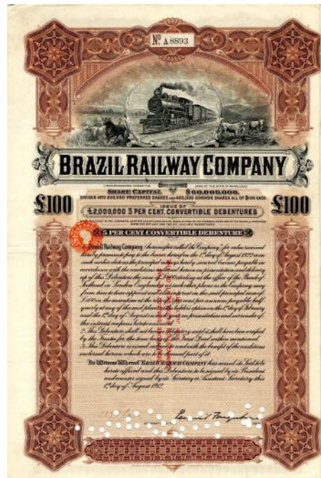
Note: photos are generic, similar to items taken

It is and has been an onerous 3.5-year process to find out what happened to my family heirlooms, some of 4 generations to be passed on to my niece and nephew and would be a joy to be able to retrieve any.