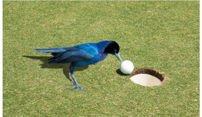
A birdie in the making?