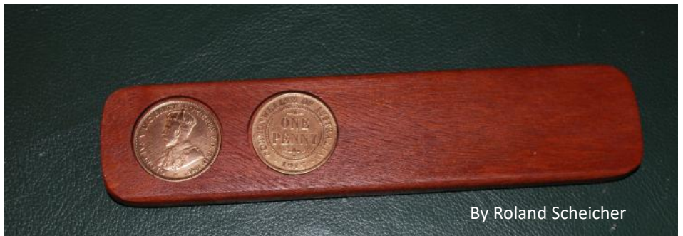
By Roland Scheicher

The predilection of the convicts for this game was noted as early as 1798 by New South Wales's first judge advocate, as well as the lack of skill involved and the large