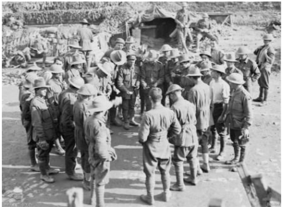
WWI Diggers playing Two-Up

Legal two-up arrived with its introduction as a table game at the new casino in Hobart in 1973, but is now only offered at Crown Perth and Crown Melbourne. Two-up has also been legalised on Anzac Day, when it is played in Returned Servicemen's League (RSL) clubs and hotels. Several tourist "two-up schools" in the Outback have also been legalised. Under the NSW Gambling (Two-Up) Act 1998, playing two-up in NSW is not unlawful on Anzac Day.