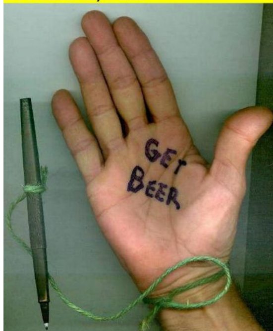
The redneck memo pad.